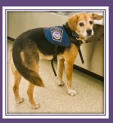
CBP Established: 2017