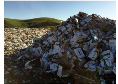
Illegally imported Chinese garlic

GAET targeted entries of Chinese garlic valued at over $16.84 million that were high-risk for evasion of antidumping duties. GAET required posting of additional single transaction bonds to strengthen security for revenue in jeopardy prior to the release of these shipments. Single transaction bonds can be thought of as an “insurance policy” for the government to assist with our ability to collect money due if there is nefarious activity involved in the transaction. Four importers/exporters challenged CBP’s authority to require additional bonding and filed several lawsuits at the Court of International Trade (CIT). As a result of the GAET enforcement efforts, CIT upheld CBP’s ability to request single transaction bonds.