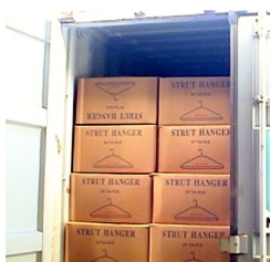
Falsely classified Chinese wire hangers

CBP imposed $3.9 million in civil penalties on three importers for evading the antidumping duty order on wire hangers from China. CBP found these importers failed to properly report the imports as subject to antidumping and failed to pay the antidumping duties. This resulted in a potential loss of revenue of $3.4 million in antidumping duties. CBP found the importers to be negligent by making false statements and false invoicing. CBP is continuing its enforcement of the antidumping duty orders on wire hangers from China, Vietnam and Taiwan.