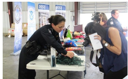
CBP personnel showing media representative sample of seized Christmas lights

The CBP Houston Seaport trade team looks forward to continued success by working innovatively and collaboratively to enforce U.S. trade laws that support the economy and protect consumers.