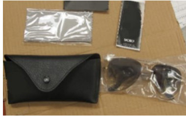
Seized counterfeit merchandise

It is difficult to conduct targeting in the express consignment environment, so as part of the daily assigned duties, CBP officers responsible for targeting and