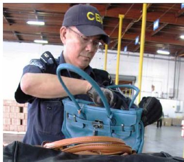
Seized counterfeit merchandise

examinations periodically examine incoming shipments at the express carrier hub. Seizures of significant values made by CBP officers at the beginning of the fiscal year have already exceeded the MSRP for Orlando in FY 2015.