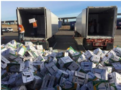
Illegally imported Chinese garlic

This resulted in shipments valued at over $5.8 million being exported back to the country of origin, as importers did not want to file additional bonds; shipments valued at over $6.9 million being exported or destroyed; and shipments valued at over $4 million released after an importer posted a $1 million bond with CIT. The GAET team also protected revenue of over $137 million from many entries in the assessment of the correct antidumping duty rate. CBP remains committed to enforcing the legal importation of garlic, as well as other commodities.