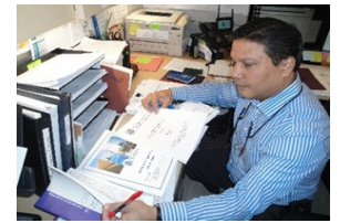
Import specialist’s vigilance and dedication to duty resulted in million dollar revenue recovery for CBP.

What appeared to be a routine entry verification at an Area Port in Puerto Rico turned out to be a prospective million dollar recovery in lost revenue. It all began when a company specializing in food imports failed to present a pallet of baby food for inspection. This incident alerted a CBP import specialist, who began to inquire about the possibility of the company’s additional lack of controls.