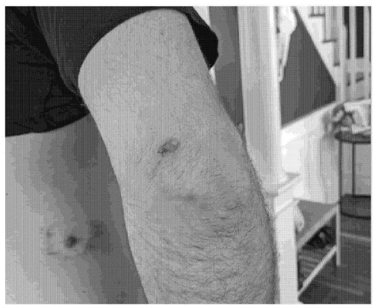
Figure 2: Two of the ten times federal agents shot Mr. Lewis-Rolland. More pictures in Lewis-Rolland Decl. ¶¶ 14-16.