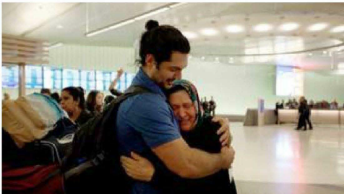
Man reunited with grandmother after she was detained at LAX