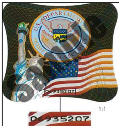
New Secure Laminate